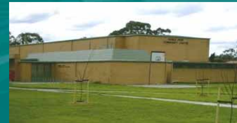
Noble Park Community Centre