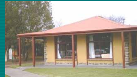
Springvale Neighbourhood House