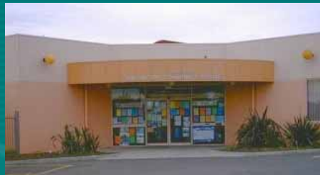
Jan Wilson Community Centre