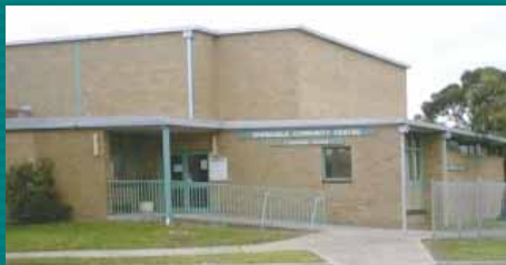
Springvale Learning & Activities Centre