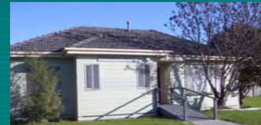
Keysborough Learning Centre