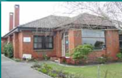
Wellsprings for Women