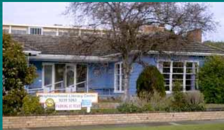
Springvale Literacy Centre