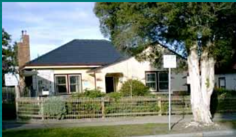
Dandenong Neighbourhood House